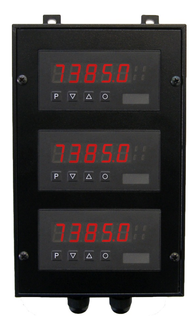
fig similar to AM1-1-3